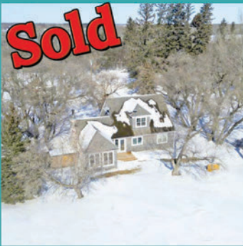
87044 ROAD 6E BALMORAL

Want to feature your upcoming event in our next magazine? Scan the QR Code or visit: www.bemyneighbour.ca to register!