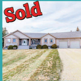
60 DYKSTRA RD. BALMORAL