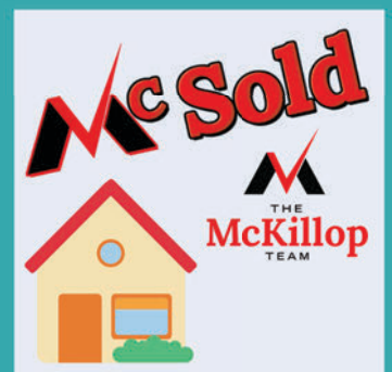
YOUR HOME COULD BE HERE: Mc Sold