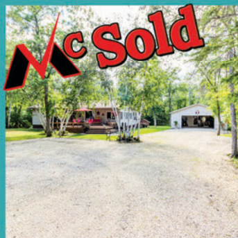
2 BIRCH GROVE ARNES