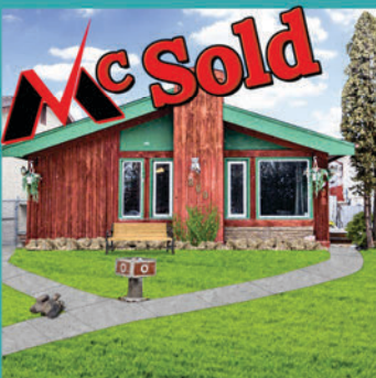
899 CARRIGAN PL. WINNIPEG