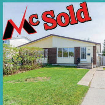
30 BERNADINE CR. WINNIPEG