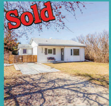
337 2ND ST. EAST STONEWALL