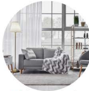
✓ Virtual Interior & Exterior Staging