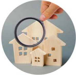
✓ Free Market Evaluation

We are dedicated to delivering exceptional results that exceed your expectations. Our focus on performance means that we prioritize the quality and effectiveness of our work, ensuring that every home we sell achieves the goal of getting your house sold at a price that makes you happy. With our expertise, experience and commitment to excellence, you can trust that our service will impress and add value to your property and achieve the optimum price. We believe selling your home should be exciting and easy. We ensure results that will impress. Let us check all the boxes on your to-do list and show you why people choose The McKillop Team.