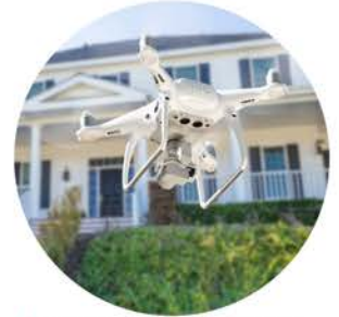
✓ Area & Property Drone Photos & Videos