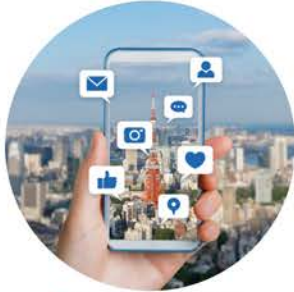
✓ Property Specific Marketing