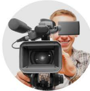
✓ Professional Property Photos & Videos