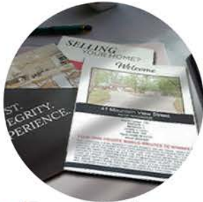
✓ Property Brochures & Print Advertising