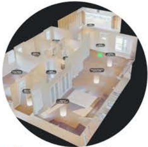
✓ Interactive 3D Tours & Floor Plans