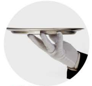
✓ 24/7 Concierge Services